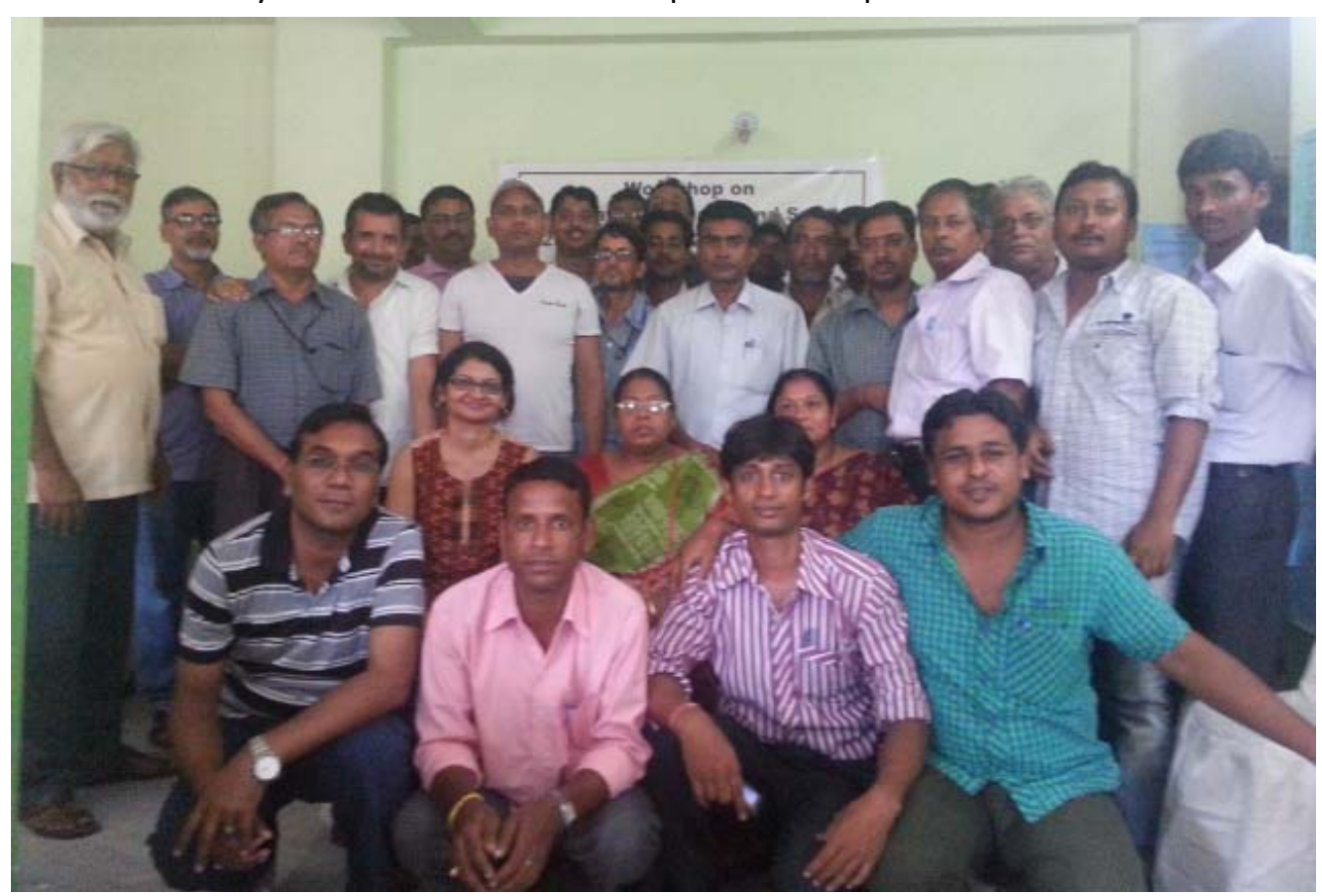
Participants in the Workshop

The training ended with a vow by all present that they will help in improving the health and safety of the workers in their respective workplaces.