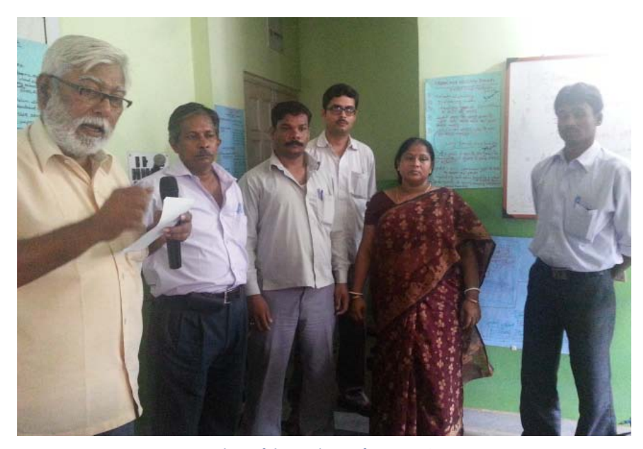
Members of the Workers Safety Committee

The training ended with a vow by all present that they will help in improving the health and safety of the workers in their respective workplaces.