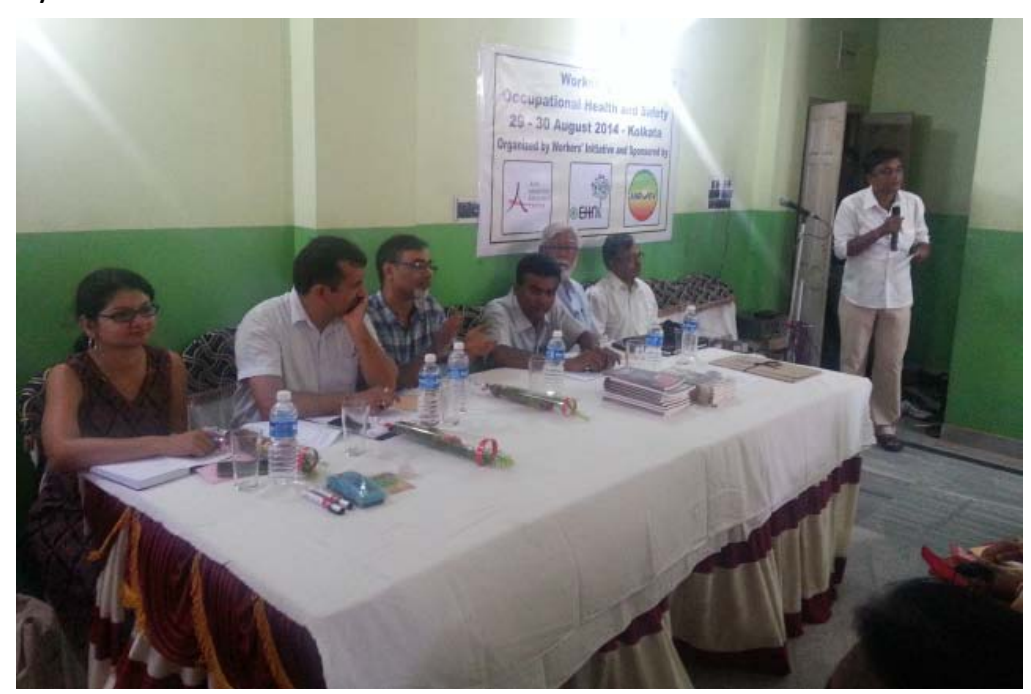
Participants being welcomed to the workshop

He added that, unfortunately except the economic demands the other two issues have largely been ignored and or undermined by the TU's. He emphasized that it is not a criticism to any organization rather being a part of workers movement it is our self-criticism and therefore we have to address the issue of occupational health and safety in proper prospective, particularly during this second phase of capital globalization era when the big industrialist houses, corporate world and MNC's are looking for profit. He urged all participants to understand the gravity of the issue and chalk outan action plan to address the issue of occupational health and safety.